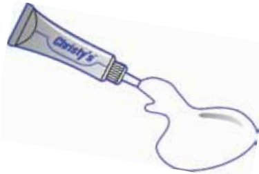
WHITE (WARM WHITE)