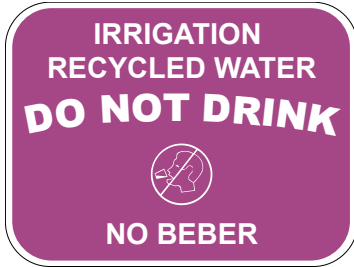
ID.SGN9X12WRW (9" x 12")

Christy's™ offers all versions below as standard Recycled/Reclaimed water identification signs for ball fields, parks, golf courses or general areas utilizing Recycled/Reclaimed water to irrigate. In addition, we offer complete signage capabilities for all of your custom signage requirements.