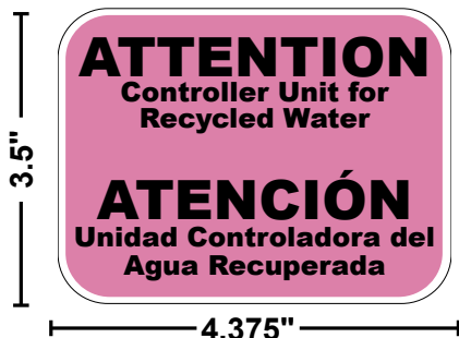
ID.4100 Color - PMS 522C

Ideal for marking controllers or enclosures controlling Recycled/Reclaimed water systems.