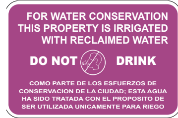
ID.SIGN.35 (12" X 18")