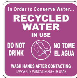
ID.SIGN.1818 (18" X 18")