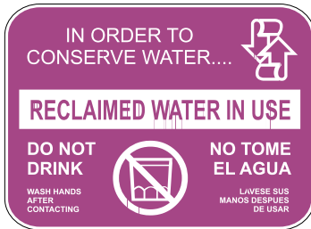
ID.SIGN.6 (9.75" X 13.25")