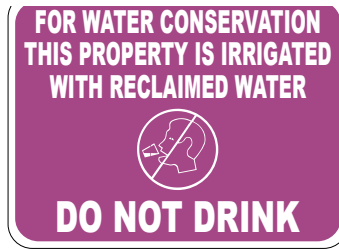
ID.SIGN.45 (9" X 12")