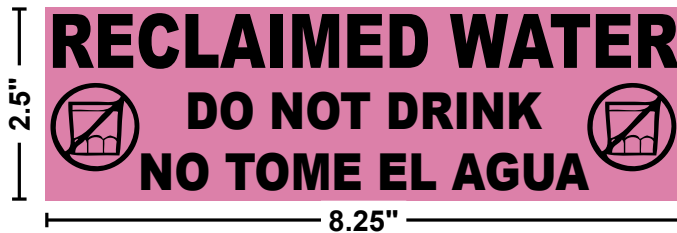
ID.4200 Color - PMS 522C

General Reclaimed Decals: Ideal for all applications utilizing Recycled/Reclaimed water systems.