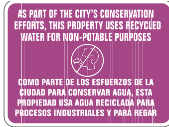
ID.SIGN.3 (18" X 24")