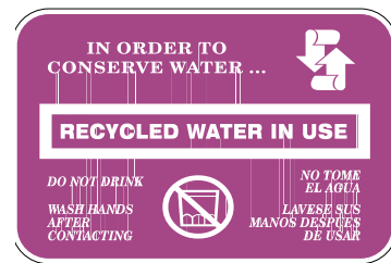
ID.SIGN.REC1218 (12" X18" )