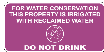
ID.SIGN.4X8 (4" X 8")