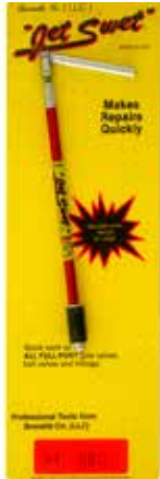
JS-75 3/4" Single Tool