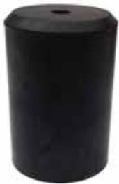
JS-012G 1/2" Replacement Gasket