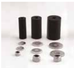
JS-1751G 1/2", 3/4", & 1" Replacement Gasket Kit