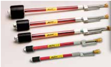
JS-295FT - JS-2095FT 1-1/2" - 4" Flo-Thru™ Single Tool