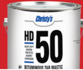
Coatings and Mastics