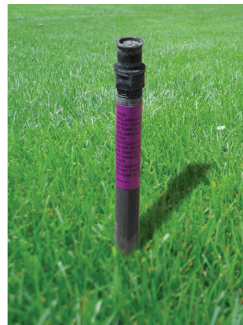
5100 Purple Riser Marker