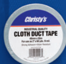
Job Site Essentials